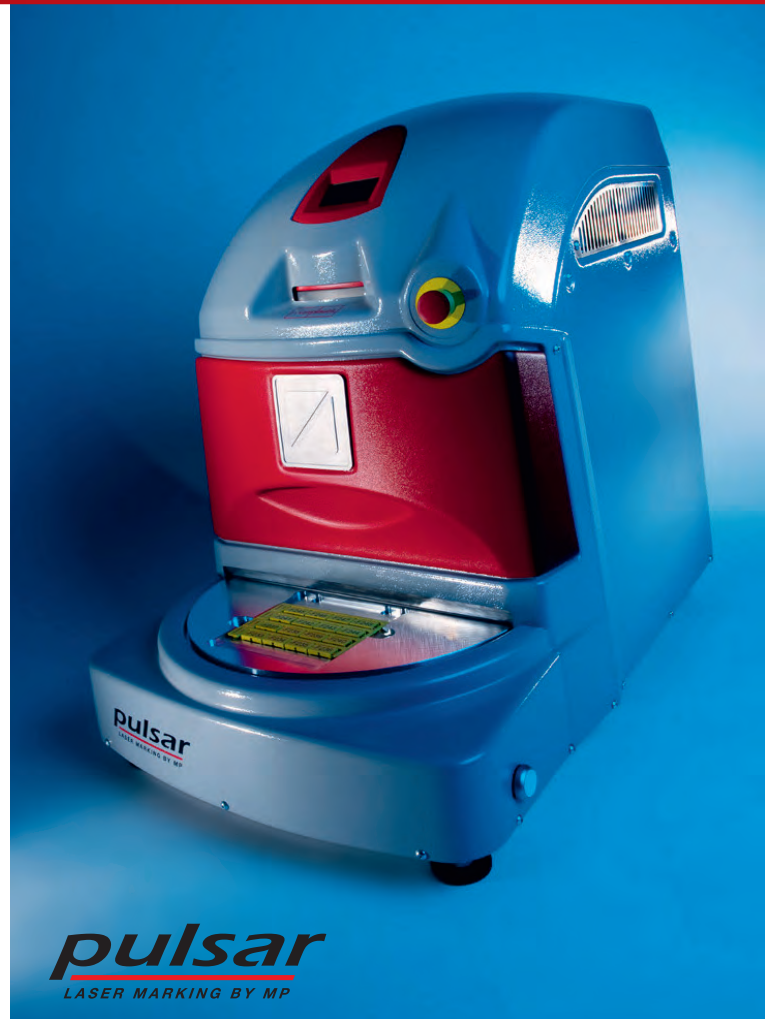
The pulsar . The universal laser labelling system!

With the pulsar laser unit, operators have the option of setting the speed and optical density of the labelling to match their requirements. Engineering design data can be loaded directly into the ACS lettering software using the integrated CAD and EPLAN interfaces. With its low initial cost, plus minimal operating and lifecycle costs, pulsar is the perfect labelling system for companies with a medium to high volume of labelling work and high standards regarding the quality of labelling produced. The pulsar can be used for labelling on ID plates for leads, lines, terminals, control panels and signalling equipment, switchgear, media devices and much more besides.